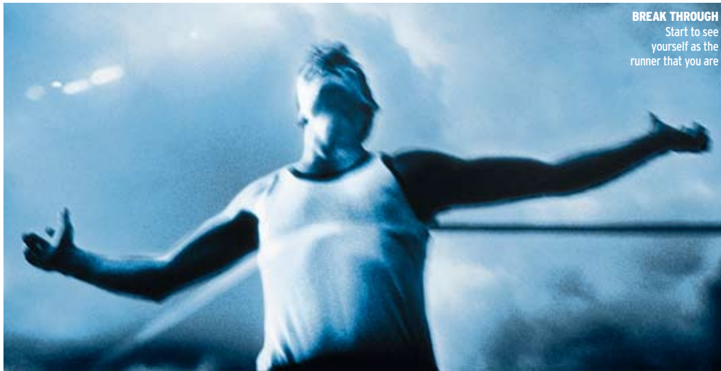
BREAK THROUGH Start to see yourself as the runner that you are